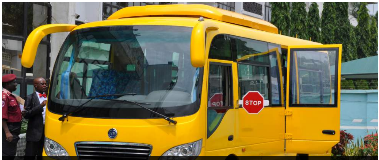
Investigations into RTCs resulting in over six deaths indicate that 5% of the deaths are from children most of whom were in a school bus. Working with stakeholders, FRSC developed uniform safety features and operations standards for vehicles used in conveying school kids.

Prior to the Corps' intervention, it was difficult to properly identify errant vehicles or their drivers. A license plate was tied to a vehicle (not a particular owner) and sometimes when the vehicle was sold or transferred, there was no proper reassignment of the license plate to the new owner.