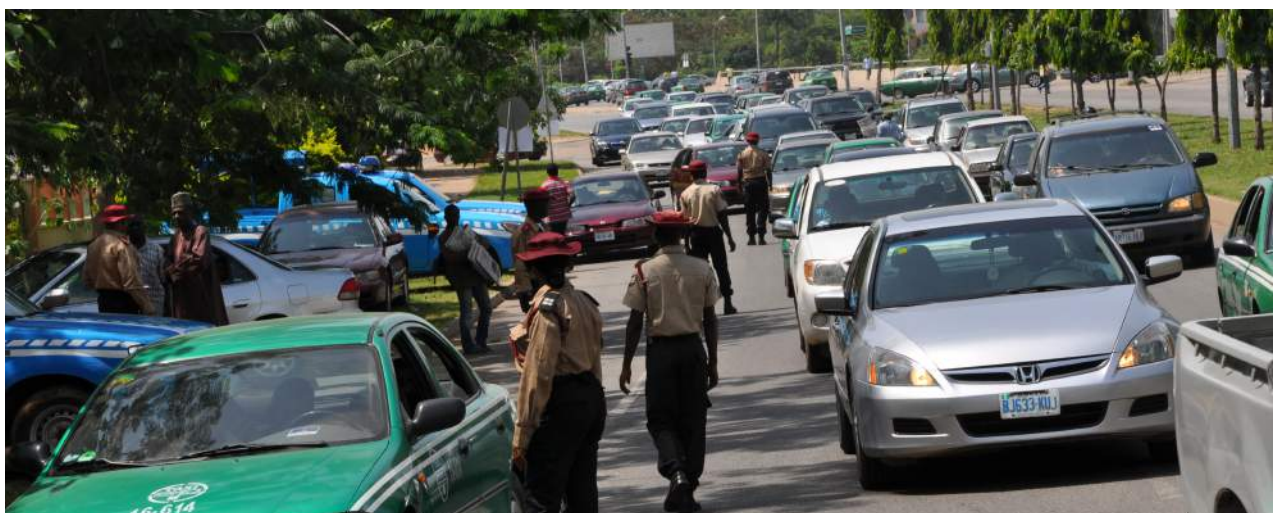
Every quarter, FRSC conducts nationwide driver-safety checks. Visual acuity tests are conducted on drivers who are selected at random.

FRSC commenced a series of public enlightenment campaigns to convince road