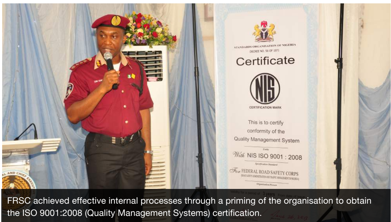
FRSC achieved effective internal processes through a priming of the organisation to obtain the ISO 9001:2008 (Quality Management Systems) certification.

To qualify for the ISO certificate, FRSC had to, over many audits, show consistency in maintaining the defined processes. The Corps' Quality Internal Systems Auditors routinely audited the various FRSC departments to ensure adherence to the defined processes. Exceptions were tabulated