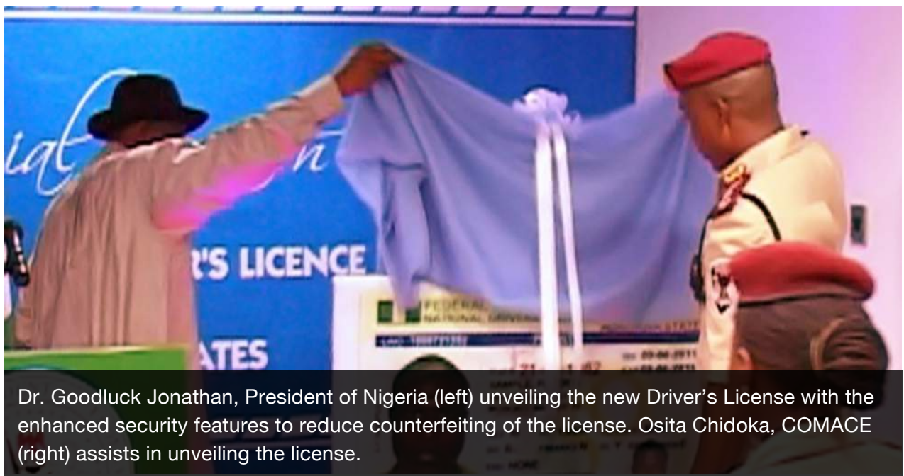
Dr. Goodluck Jonathan, President of Nigeria (left) unveiling the new Driver's License with the enhanced security features to reduce counterfeiting of the license. Osita Chidoka, COMACE (right) assists in unveiling the license.

On September 2, 2011 President Goodluck Jonathan commissioned the new system that offers a 'one-stop shop' drivers' license processing. All new license applicants must complete a 3-6 months driving school programme after which the applicant has to pass a driving test provided by the Vehicle Inspection Office. Successful candidates can obtain an application from the Drivers Licensing Centre or online. Each candidate is expected to provide mandatory biometric data, a passport photo, and pass a visual acuity test. Unlike the old system, all issued driver's licenses can be auto-verified because all applicants are registered on a shared database.