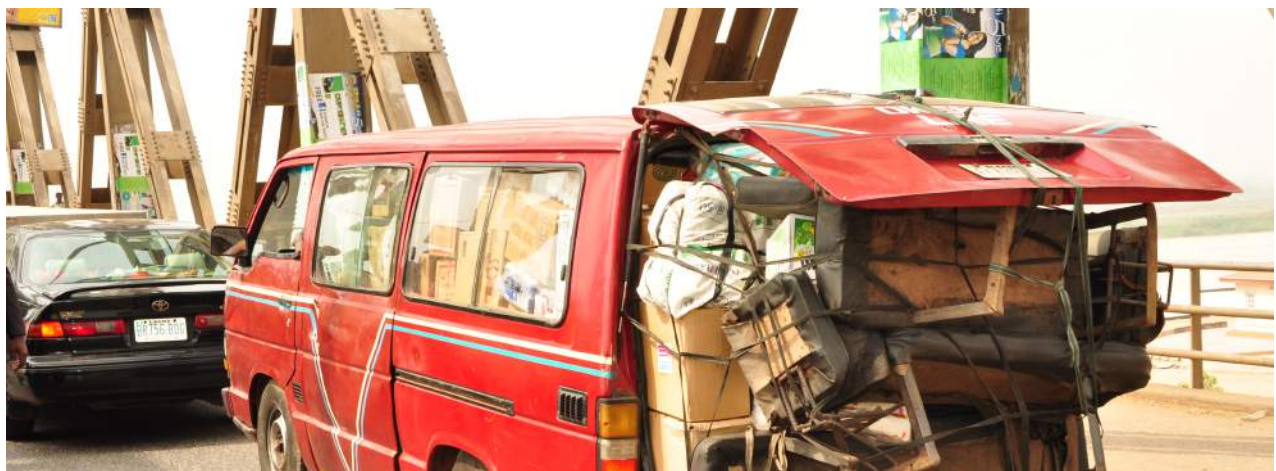
Vehicle overloading is one of the top causes of road traffic crashes in Nigeria. In 2009, FRSC introduced Total War on Over-Loading, an initiative that ensures zero tolerance to over-loading of motor vehicles. There has been year-on-year improvement in enforcement.

Communication: FRSC provides each hospital